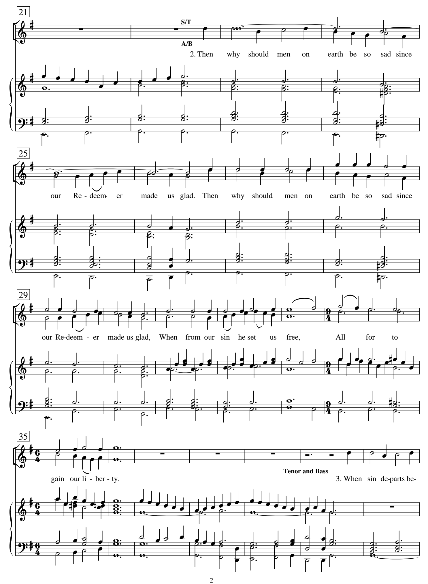
Music arrangement copyright © 2008 R. Mather. May be reproduced and performed This music must not be available from any other web site without permission. www.cantatedomino.org