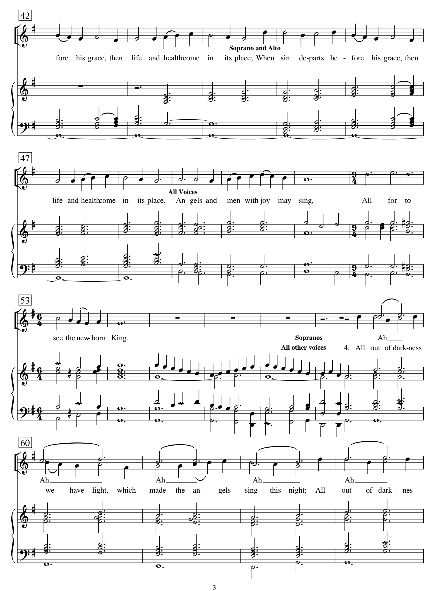
Music arrangement copyright © 2008 R. Mather. May be reproduced and performed This music must not be available from any other web site without permission. www.cantatedomino.org